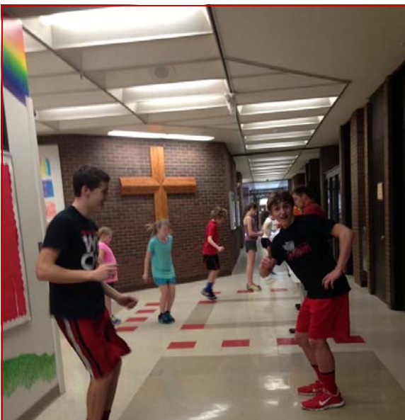
Track Season is underway at both jr. high and high school levels. This practice was held indoors because the weather was not cooperating!