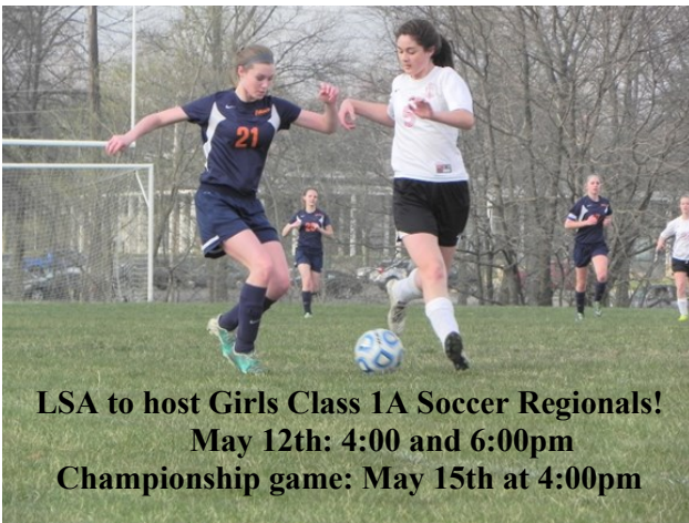
LSA to host Girls Class 1A Soccer Regionals! May 12th: 4:00 and 6:00pm Championship game: May 15th at 4:00pm